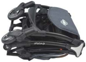
Frame with 2 front wheels and canopy

If are missing any parts, please contact Customer Service at 732 752 7220