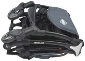
Frame with 2 front wheels and canopy

If are missing any parts, please contact Customer Service at 732 752 7220